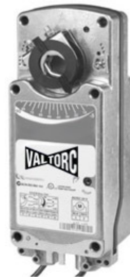
Electric Spring Return Actuator SERIES 900

The SERIES 900 Electric Spring Return Actuators provide reliable control of dampers and valves in Heating, Ventilating, and Air Conditioning (HVAC) systems. The SERIES 900 Actuators are available for use with on/off, floating, and proportional controllers.